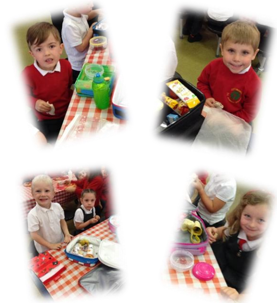
OUR FIRST LUNCH!